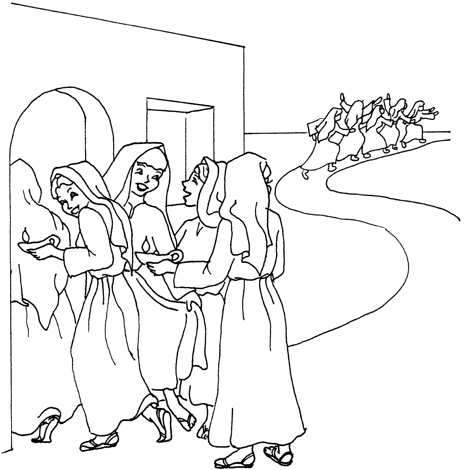
"Jesus tells a parable about ten maidens." Matthew 25:1-13